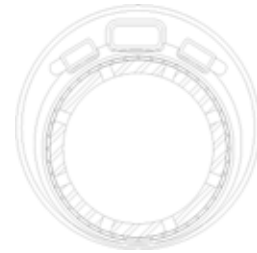
1TT x 2PT OH STS

Custom sizes and metallurgies available upon request to meet specific completion criteria.