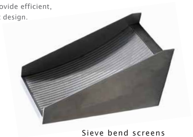
Sieve bend screens